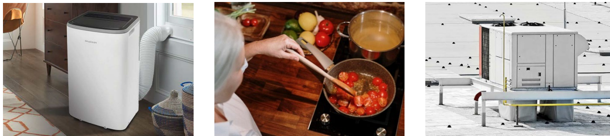
Figure 2. Phase II MTI idea photos

These Advancement Plans were reviewed and commented on by the MTAB members as well as posted for public comment in December 2023. In January 2024, the CalMTA team will respond to comments and incorporate when possible. Final Advancement Plans will be presented to the MTAB in January and once approved by the CPUC, the above MT ideas will advance to Phase II: Program Development.